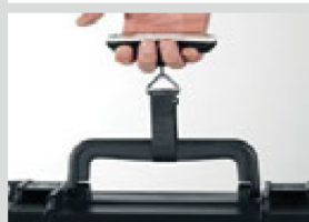
CarryMax Compact, digital hanging scale

The temperatures for different types of meat are marked on the device.